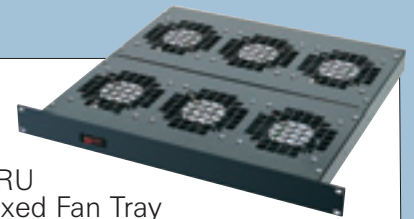
1RU Fixed Fan Tray

A good solution, particularly for cage type (e.g. Eurocard etc.) equipment with both the top and bottom covers removed.