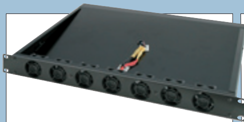
1RU Fixed Fan Unit

For quieter operation, fan speed controllers are now available. Please ask our sales staff for more details.