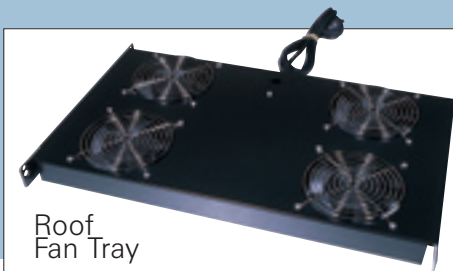
Roof Fan Tray

Suits the new Series 210 cabinets. This fan tray also suits Series 2005, Type A and Type B and should always be used with a Grille Top Panel. All fans are fitted with finger guards and do not encroach into the racking area.